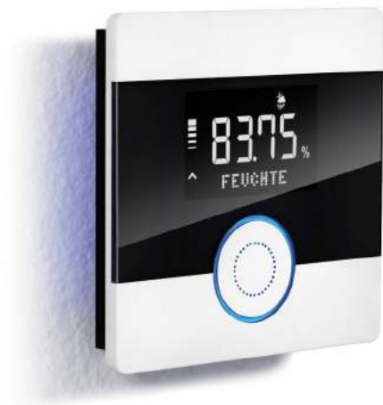
Figure 16: Enertex® SynOhr MultiSense KNX - white (RAL9010) powder-coated version