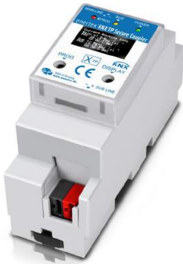
Figure 7: Enertex® KNX TP Secure Coupler