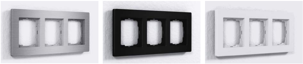
Figure 25: Enertex® AluRa 1-times, brushed aluminum, black anodized and glossy white powder-coated (RAL9010)