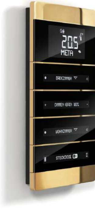
Figure 18: Enertex® MeTa® KNX PREMIUM (starting from left): glossy white powder-coated (RAL9010), brass shiny gold plated