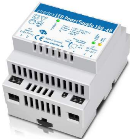
Figure 28: Enertex® PowerSupply 160-48