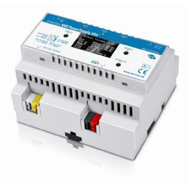
Figure 10: Enertex® PowerSupply 960 3