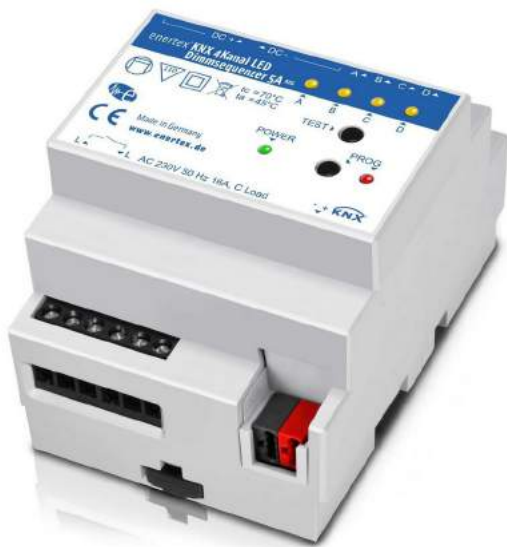
Figure 9: Enertex® KNX 4Kanal LED Dimmsequenzer 5A – REG-Version