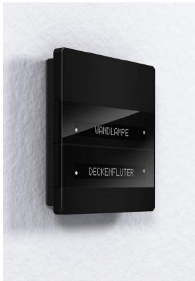
Abbildung 19: Enertex® MeTa® KNX STANDARD/STARTER (v.l.): Brushed aluminum, black anodized aluminum