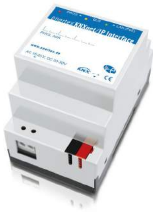
Figure 4: Enertex® KNXnet/IP Interface