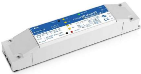
Figure 8: Enertex® KNX 4Kanal LED Dimmsequenzer 5A – DK-Version