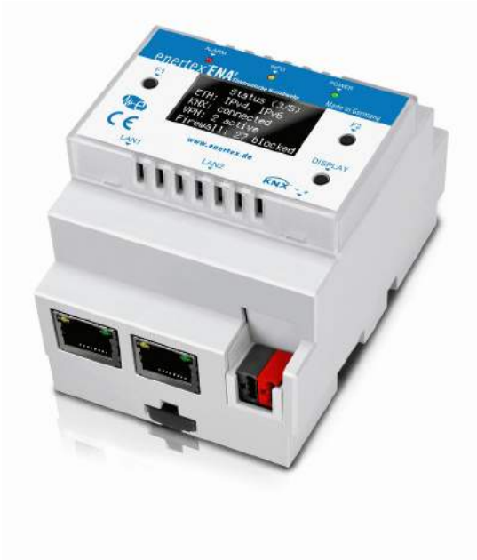
Figure 2: Enertex® ENA 2