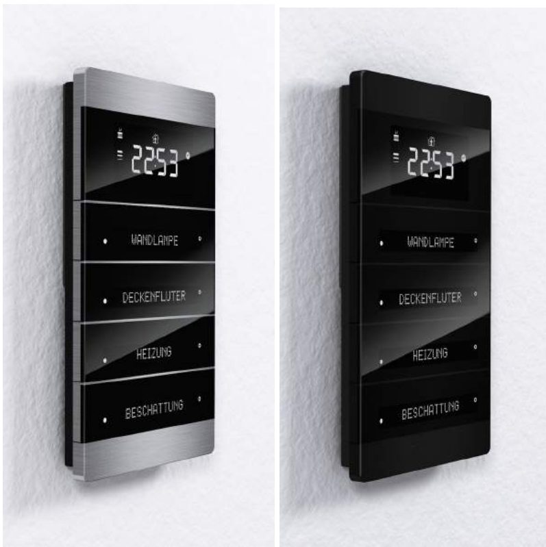
Figure 17: Enertex® MeTa® KNX PREMIUM (starting from left): Brushed aluminum, black anodized aluminum