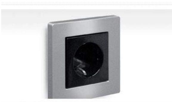
Figure 22: Enertex® AluRa 1-times, brushed aluminum with black insert JUNG (AS 500)