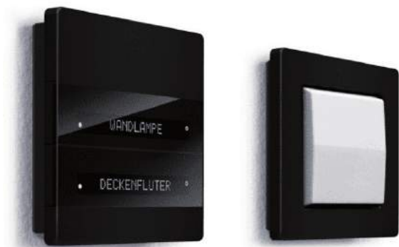
Figure 21: Enertex® AluRa 1-times, black anodized aluminum (right) with white insert JUNG (AS 500)