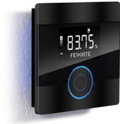
Figure 15: Enertex® SynOhr MultiSense KNX - black anodized version