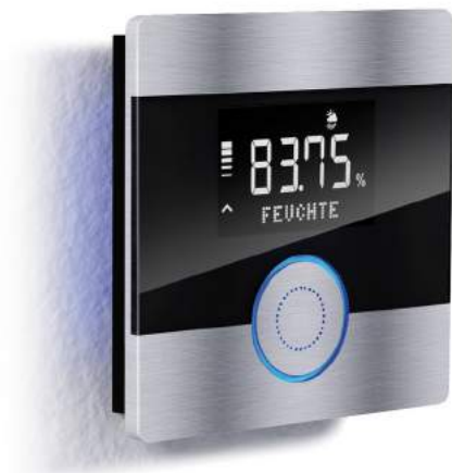
Figure 14: Enertex® SynOhr MultiSense KNX - silver anodized version