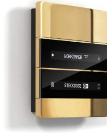
Abbildung 20: Enertex® MeTa® KNX STANDARD/STARTER (v.l.): glossy white powder-coated (RAL9010), brass shiny gold plated