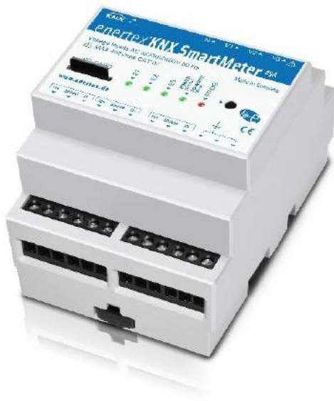
Figure 12: Enertex® SmartMeter