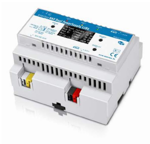
Figure 11: Enertex® PowerSupply 960 3