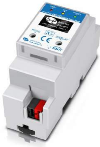
Figure 6: Enertex® KNX IP Secure Interface