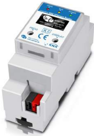
Figure 5: Enertex® KNX IP Secure Router