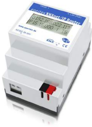
Figure 3: Enertex® KNXnet/IP Router