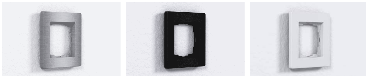
Figure 23: Enertex® AluRa 1-times, brushed aluminum, black anodized and glossy white powder-coated (RAL9010)